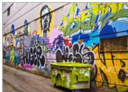
2017 BEST PHOTO: Louise Pollock